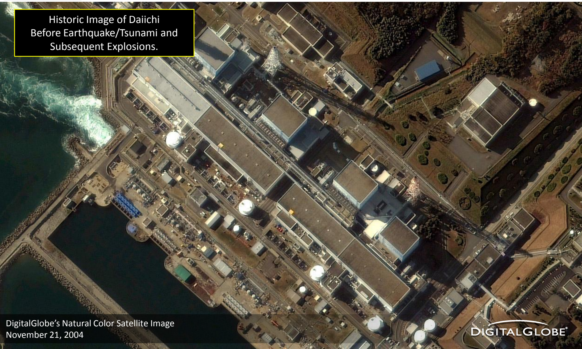
DigitalGlobe's Natural Color Satellite Image November 21, 2004

Historic Image of Daiichi Before Earthquake/Tsunami and Subsequent Explosions.