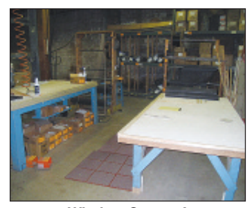
Window Screen Inventory With Screen Assembly Stations & Raw Materials