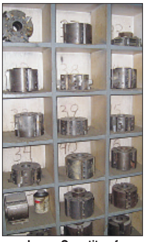
Large Quantity of Moulder Tooling