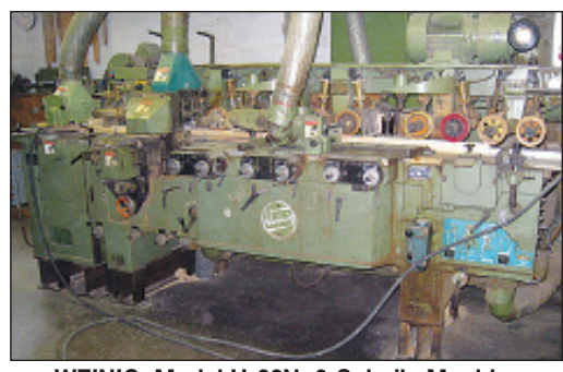
WEINIG Model U-22N 6-Spindle Moulder New 1978, Canted Roller Feed, Bottom, Right, Left, Top, Bottom, Universal, 6000 RPM, 20 - 120 FPM S/N 2809/2179