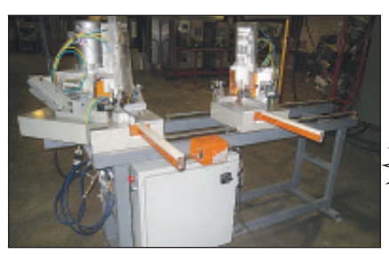
SAMPSON CM4000 2-Point Corner Cleaner

60" Adjustable, Saw/Milling Cutter S/N 94504