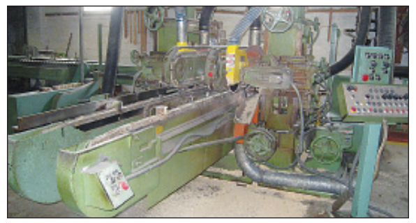
(2) GREENLEE Model 545 Double End Tenoners Cut-off, Top & Bottom Tenon, Cope, Angle Gain, with Belt Conveyor S/N 99602, 5656

Sale Date: Wednesday, May 26, 2010 10:00 am CDT