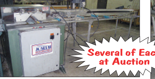
(2) JOSEPH Model 0276-00 MVN 45/45 Double Miter Cut Saws

Model DRO-10 10' Measuring Gauge Tables, 16" Saw Blades, 3 HP, Pneumatic S/N 113-6-494, 190-1-197