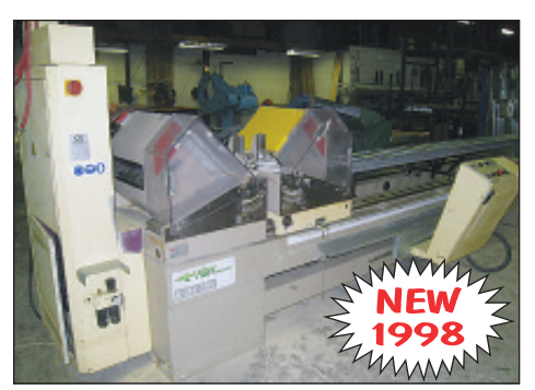
FOM INDUSTRIES Model EX10212 Blitz 45V Double End Adjustable Miter Saw New 1998, 2800 RPM, 84" Length, Roller Run-out Table S/N 011573