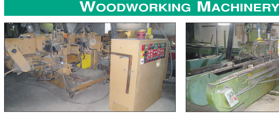
SCMI Model DETA-2 Double End Tenoner Cut-off, Scoring, Tenon, Trim with Frequency, Lateral Feed S/N KK002555