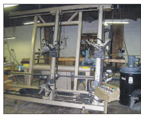
TRIAD Model FTWP Clamp Type Assembly Machine (4) Nail Guns, 90" x 72", PLC Controls

(4) Auto Screw Guns & (4) Senco Nailers, 8' x 4' Adjustable, (2) Vibratory Feed Bowls, Allen Bradley PLC Controls S/N CP96C4128