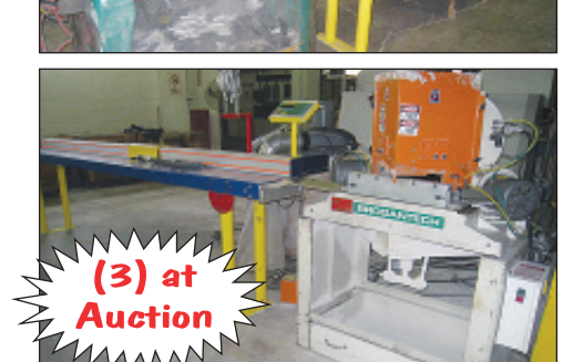
(3) SAMPSON MN Double End Adjustable Miter Saws Roller Feed, Pneum. Clamping S/N 4027, 4326