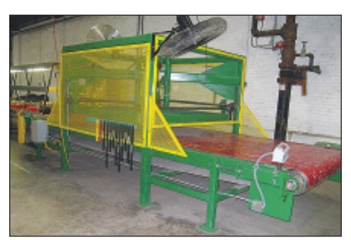
72" x 84" Platen Pneumatic Press & Motorized Roller Conveyor

(4) Auto Screw Feed Heads, (2) Vibratory Bowl Feeders, Allen Bradley PLC Controls S/N 48537