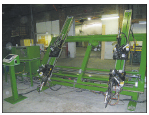
CARLSON ENGINEERING Model D46A 4-Point Programmable Sash Assembly Clamp Machine

60" Adjustable, Saw/Milling Cutter S/N 94504