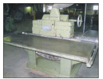
MATTISON 404 Straight Line Rip Saw 65" x 77" Table, 20 HP, 14' Max. Blade, 1-1/2" Dia. Arbor, 60 - 180 FPM S/N 20846